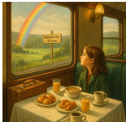
A favorite image from "Invisible Light", Mary arriving in Breverton, MA. The Rainbow appearing. Setting the stage for all things "Light".

I'm using the "Hardy Boys" series as the model.....Over 50 books published in that series. The author of that series, Franklin W. Dixon, was a busy man. Actually, he had many (?) ghost writers following the prescribed storyline. I've written 2.5 books so far. I don't intend to bring ghosts onboard, and I have several ideas for the future books. And remember, it's fun.